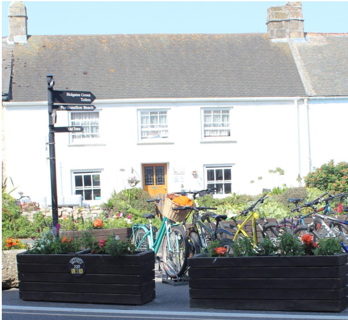
u3a community project Hugh Town, St Marys, Isles of Scilly